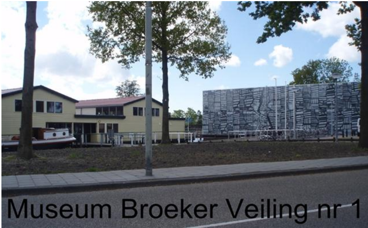
Museum Broeker Veiling nr 1